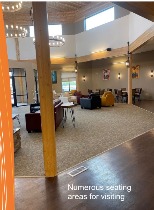
Numerous seating areas for visiting